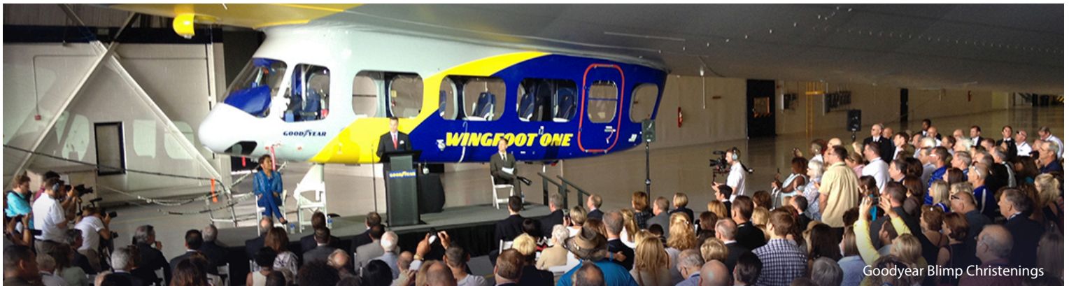
Goodyear Blimp Christenings

Wizard of Ahs maintains sales, marketing, and/or technical services in New York City, Cleveland, OH, Salt Lake City, UT, and Ft. Lauderdale, FL. The main phone number is 212.986.5406 in New York, 216.561.5700 in Cleveland, and 754.999.0094 in Ft. Lauderdale.