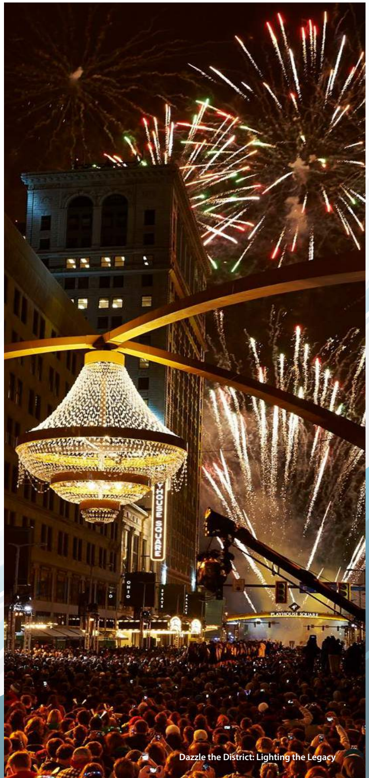
Dazzle the District: Lighting the Legacy

Creativity. Knowledge. International Experience. Trust. And most importantly—Comfort. Wizard of Ahs is an event planning and production company that has been creating spectacular events for over 35 years. Wizard of Ahs is based out of three convenient locations in New York, Cleveland, and Ft. Lauderdale. The event producers at Wizard of Ahs have experience creating and planning events all over the world. From grand openings and corporate meetings to ceremonies and spectacles, Wizard of Ahs has done it all.