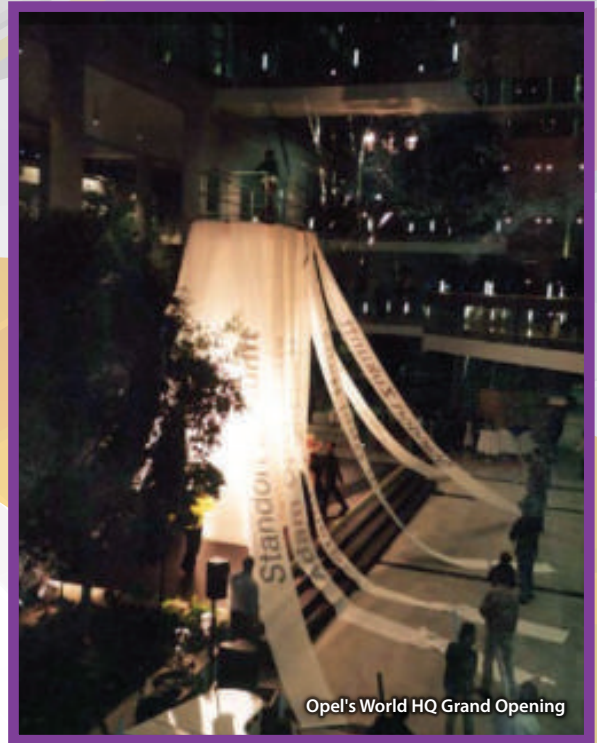
Opel's World HQ Grand Opening